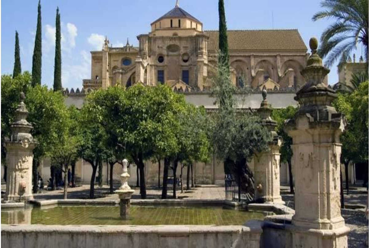
COURTYARD AND MINARET